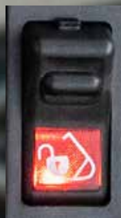
Safety Switch (backhoe)