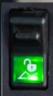
Safety Switch (loader)

Disables the control lever of loader, backhoe (excavator), and stabilizer levers by flipping the safety switch on the side console